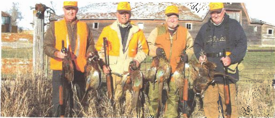
2017 South Dakota Decorated Veteran Pheasant Hunter's