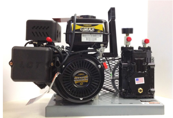
H50GL (Gas Powered)