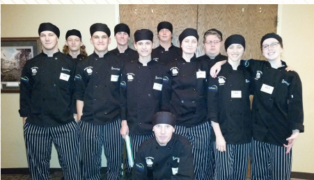
Culinary Arts students

Mark your calendars for this year's event: Friday, October 28, 2016 –The 7th Annual MCSEF Philanthropy Dinner.