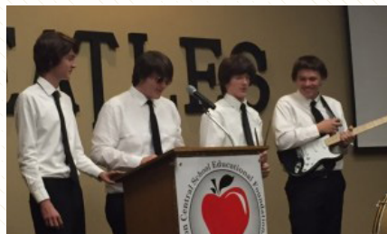
Our Beatles, promoting the Have A Seat! campaign