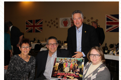
Members of the Class of 1970 at the Philanthropy Dinner last November.