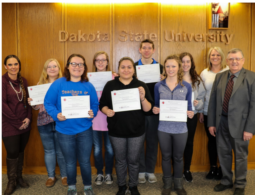
Madison High School Alumni receive Step-Up Scholarships.