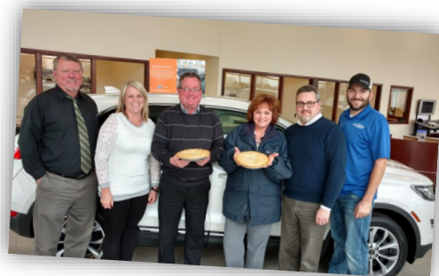
Prostrollo Auto Mall employees excited for their blueberry & cherry pies.